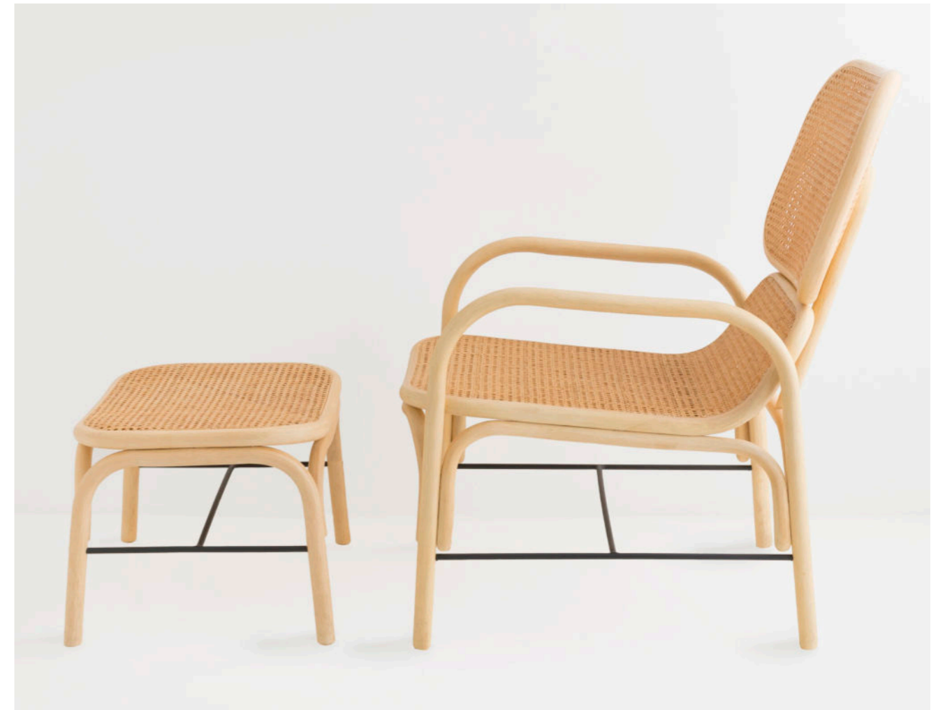
PLUS CANNE Foot stool - page 6