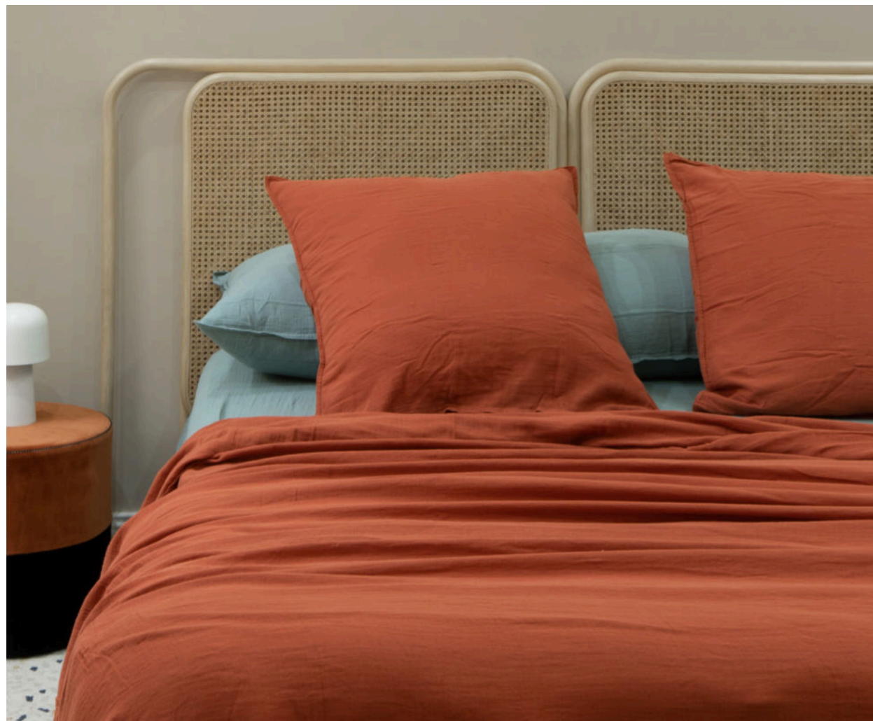
PASSAGE headboard - page 20 / Banc TRAVERSE Bench - page 7