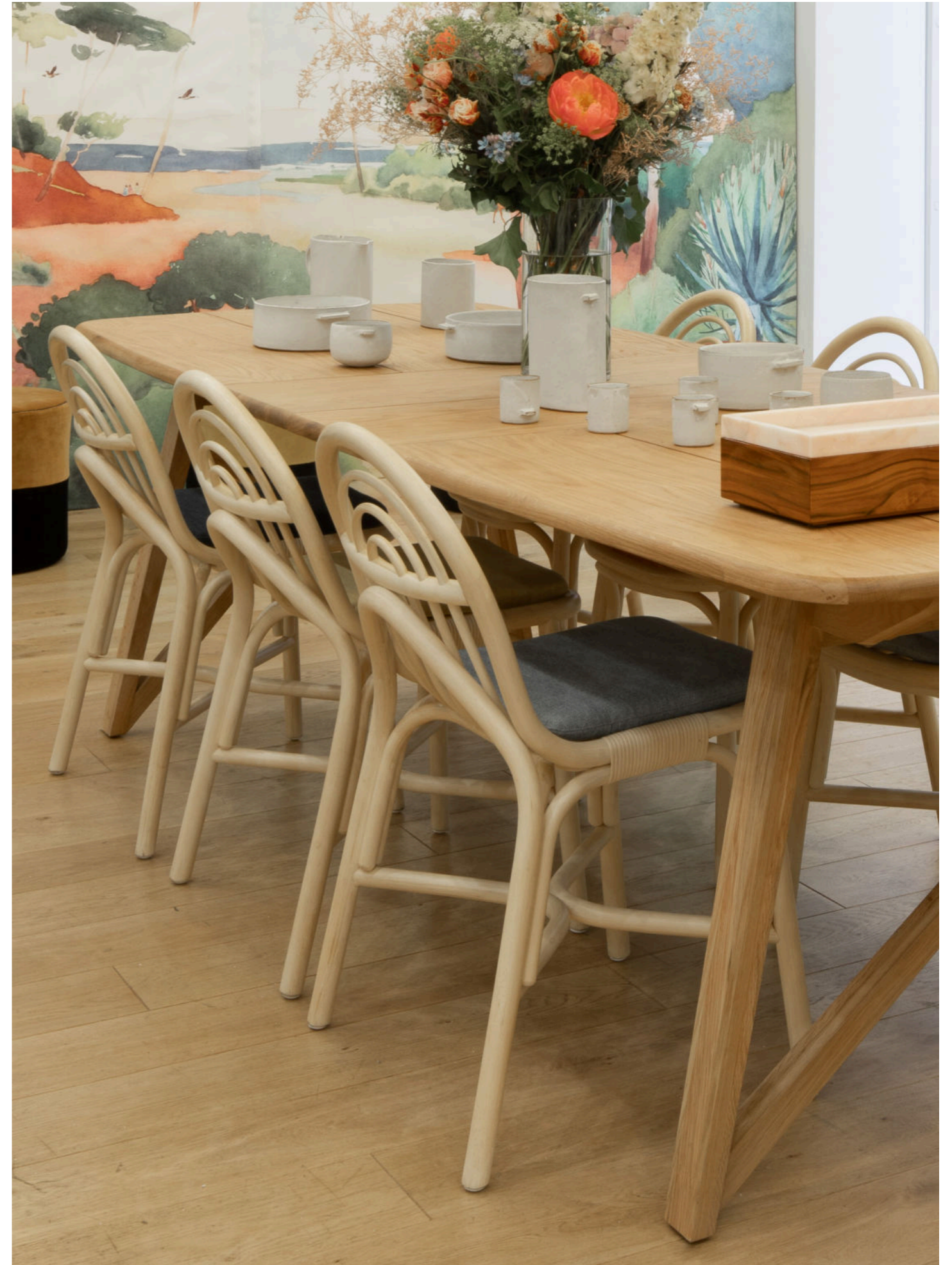
SILLON Chair - page 17